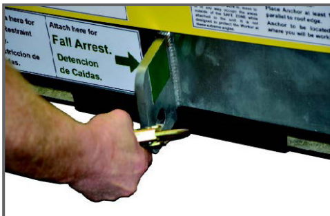
Your lanyard can connect to either the fall-restraint or the fall-arrest.