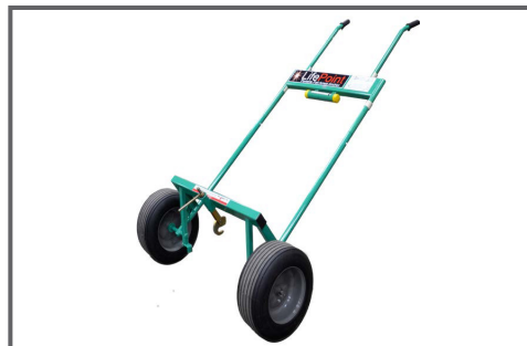
Optional Transport Cart