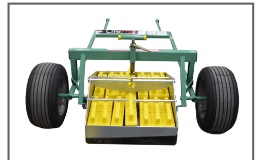
To move cart, position cart, raise DynaWeight, and move to new location.